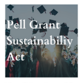
The Pell Grant Sustainability Act indexes the Pell Grant to keep up with inflation.