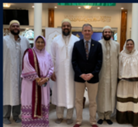
In November, I joined the Dawoodi Bohra Community to tour their mosque and brand-new school and learn about the services and programs the community provides.