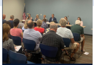
I hosted my 8th town hall of the year in Palos Hills.

In August, I hosted a roundtable discussing book bans with a panel of experts.