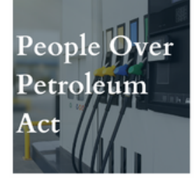
This bill would repeal fossil fuel subsidies and provide a cash rebate to Americans.