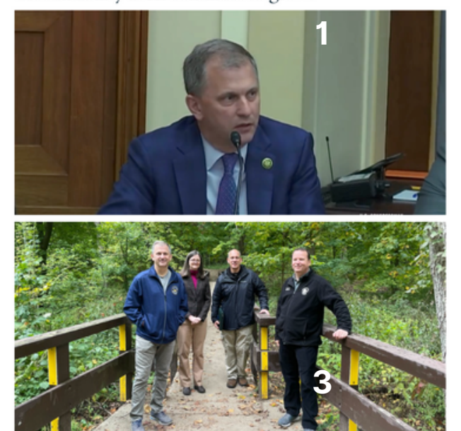
I met with the DuPage Forest Preserve to discuss their plans for a brand new bridge in the Maple Grove Forest Preserve.

I addressed the Financial Services Committee about the need for a legal framework in place to ensure accountability as AI continues to grow.