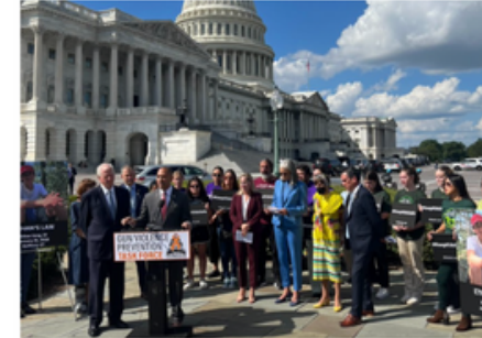
I joined the Gun Violence Prevention Task Force to call for commonsense legislation to keep our communities safe.