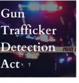
This bill would require gun owners to report if their gun is lost or stolen within 48 hours.

This month, I introduced three bills to lower costs for Americans, help families afford college education, and keep our communities safe from illegal weapons.